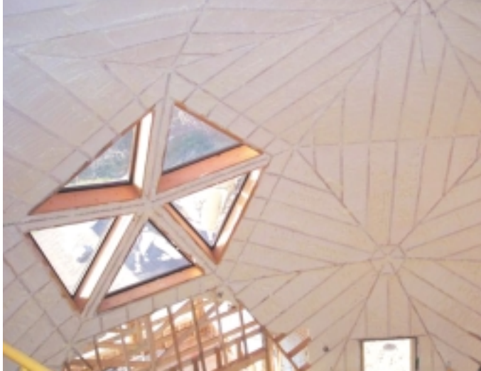
Complicated Designs –Wood or Steel Frames

By using Icynene®, you can offer your customers the quality, craftsmanship and innovative design they demand.