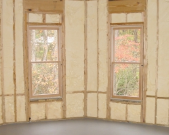
Basements, Crawspaces, and Floors