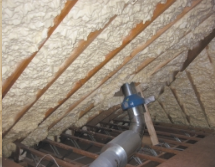
Attics and Ceilings